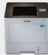
M4530ND (45 ppm)