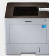
M4530NX (45 ppm)