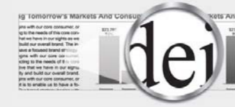
De-ICE (Integrated Cavity Effect)